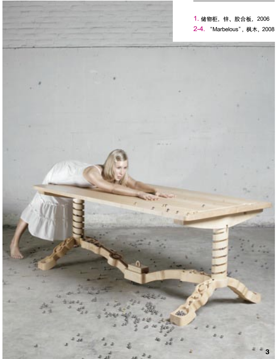
1. 储物柜，锌、胶合板，2006 2-4. “Marbelous”，枫木，2008